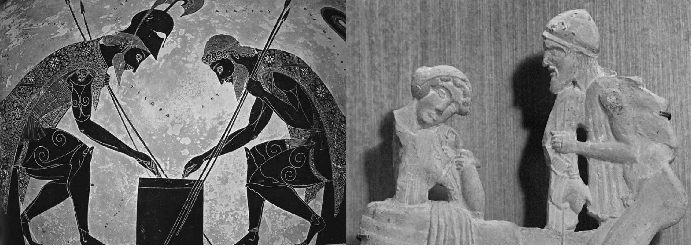
Achilles and Ajax amphora by Exekias, c.530 BC, Vatican Museums, Vatican City.

RTE: Is The Iliad , then, an expression of remorse for the destruction of war?